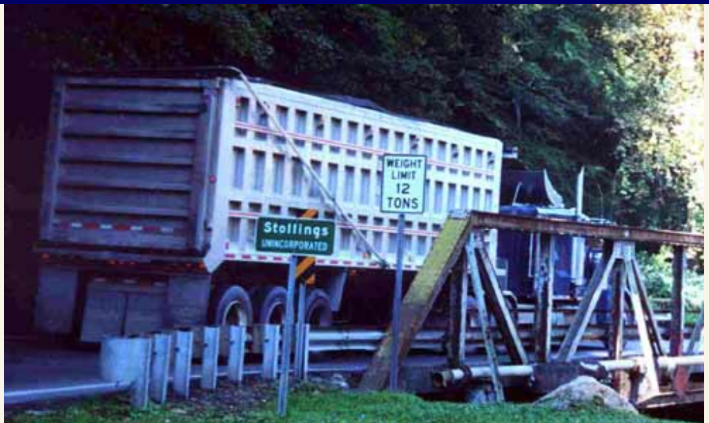
Click here for close up photos of Stollings Bridge

Even empty, coal trucks weigh 40,000 to 50,000 pounds. Overweight coal trucks inflict exceedingly costly damages to our bridges and roads. Please call, e-mail and write your legislators today, and ask your friends and family to do the same.